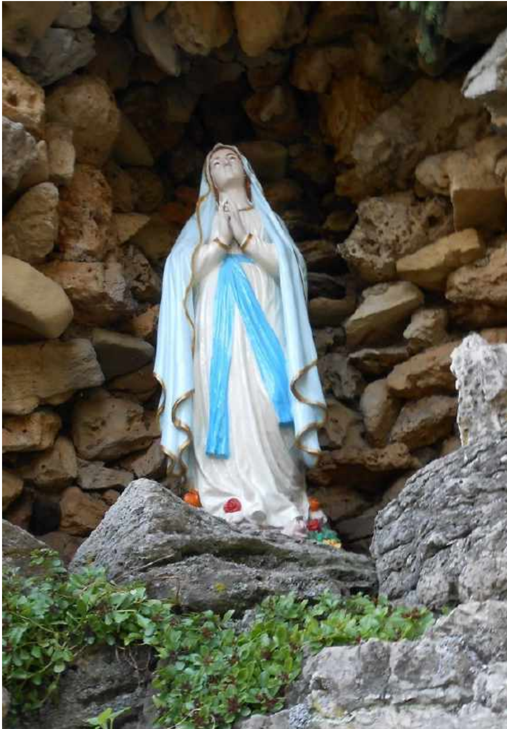
Our Lady of Lourdes grotto at Sacred Heart Monastery