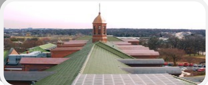
The restored roof, cupola and cross on the roof of Villa St. Benedict and Sacred Heart Monastery.

“Almighty God, we ask your blessing upon this restoration project, its builders and its donors who helped Villa St. Benedict and Sacred Heart Monastery make this possible. As we bless this project with holy water, send your guardian angel, placed before this building, to bless us and all those who live and work here. May this project keep us safe from all water damage as we continue to minister to the needs of one another. May we look kindly on all who enter. “