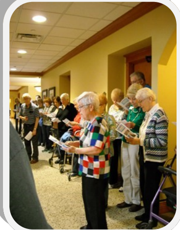
Blessing of the additional Administrative Offices.

May all who work in these offices greet one another and receive others as if they were Christ Himself. May our core values of Hospitality, Respect, Stewardship and Justice be the guiding force of all our communication and decisions.”