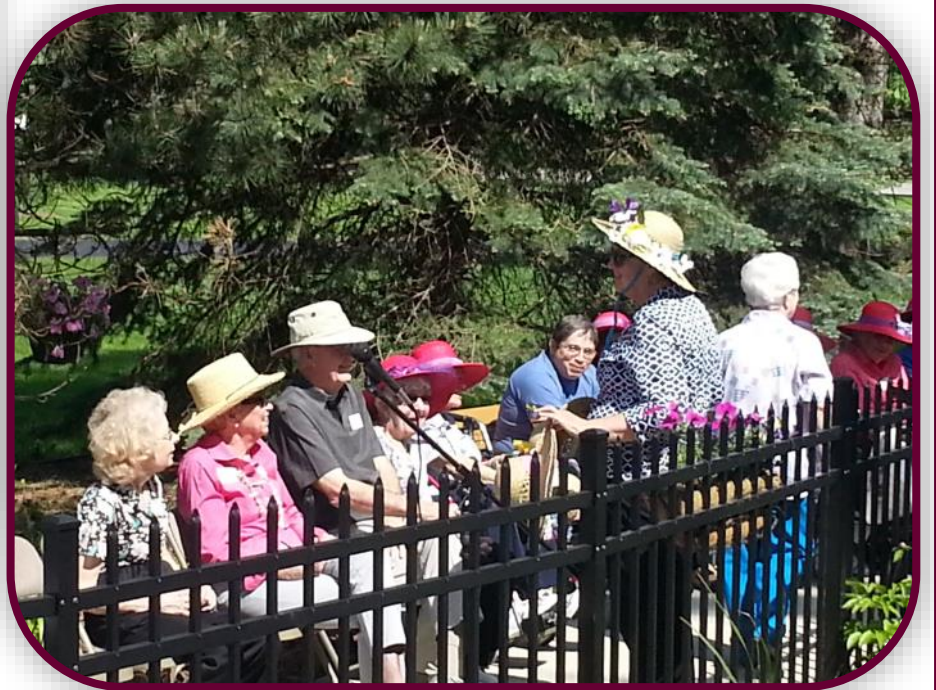
Gathering at the Grotto for the rosary on a beautiful May afternoon